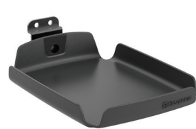
HUSQVARNA ASPIRE™ STORAGE ACCESSORY SHELF 536 65 60-01