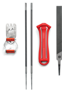
FILE KIT 586 93 34-01