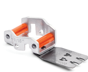
COMBINATION GAUGES 586 93 84-01