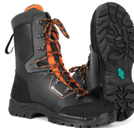
PROTECTIVE LEATHER BOOTS WITH SAW PROTECTION, CLASSIC 597 65 94-46