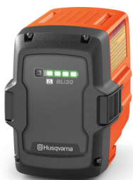
HUSQVARNA BATTERY BLI30 967 93 77-01