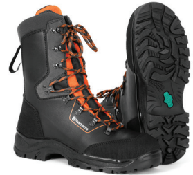
PROTECTIVE LEATHER BOOTS WITH SAW PROTECTION, CLASSIC 597 65 94-43