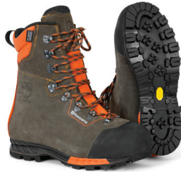
PROTECTIVE LEATHER BOOTS WITH SAW PROTECTION, FUNCTIONAL 24 597 65 93-43