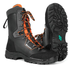
PROTECTIVE LEATHER BOOTS WITH SAW PROTECTION, CLASSIC 597 65 94-39