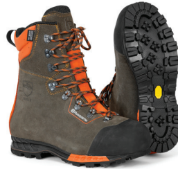
PROTECTIVE LEATHER BOOTS WITH SAW PROTECTION, FUNCTIONAL 24 597 65 93-44