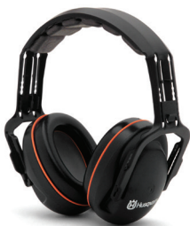
HEARING PROTECTION WITH HEADBAND 505 66 53-04