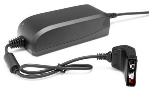
HUSQVARNA CHARGER QC80 967 96 47-03