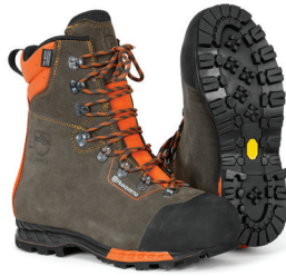
PROTECTIVE LEATHER BOOTS WITH SAW PROTECTION, FUNCTIONAL 24 597 65 93-39