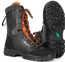
PROTECTIVE LEATHER BOOTS WITH SAW PROTECTION, CLASSIC 597 65 94-41