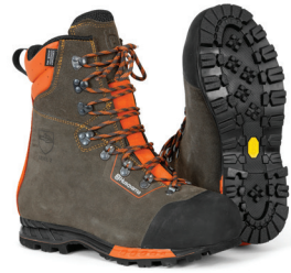
PROTECTIVE LEATHER BOOTS WITH SAW PROTECTION, FUNCTIONAL 24 597 65 93-41