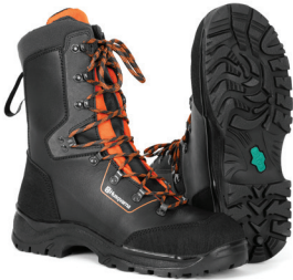
PROTECTIVE LEATHER BOOTS WITH SAW PROTECTION, CLASSIC 597 65 94-40