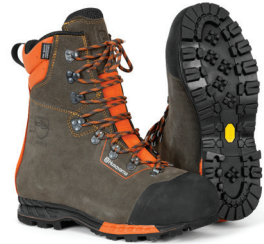
PROTECTIVE LEATHER BOOTS WITH SAW PROTECTION, FUNCTIONAL 24 597 65 93-45