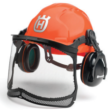
FOREST HELMET, CLASSIC 580 75 43-01