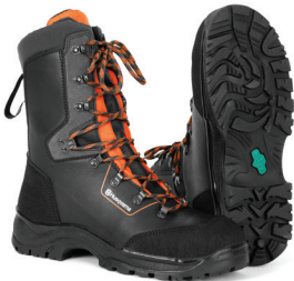
PROTECTIVE LEATHER BOOTS WITH SAW PROTECTION, CLASSIC 597 65 94-44