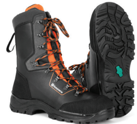
PROTECTIVE LEATHER BOOTS WITH SAW PROTECTION, CLASSIC 597 65 94-47