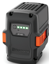
HUSQVARNA 40-B140 970 45 72-01