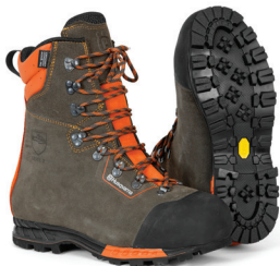
PROTECTIVE LEATHER BOOTS WITH SAW PROTECTION, FUNCTIONAL 24 597 65 93-46