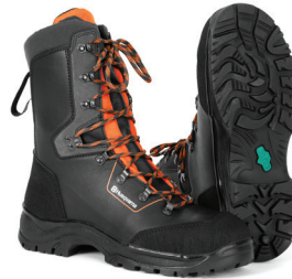
PROTECTIVE LEATHER BOOTS WITH SAW PROTECTION, CLASSIC 597 65 94-42