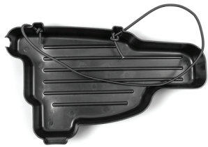
HUSQVARNA CHAINSAW BASE 536 94 48-01