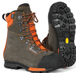
PROTECTIVE LEATHER BOOTS WITH SAW PROTECTION, FUNCTIONAL 24 597 65 93-47