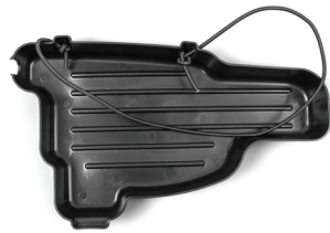
HUSQVARNA CHAINSAW BASE 536 94 48-02