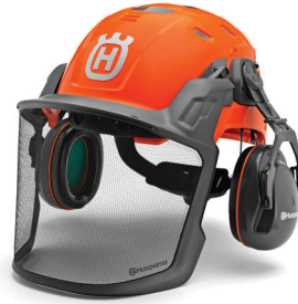
FOREST HELMET, TECHNICAL 585 05 84-01