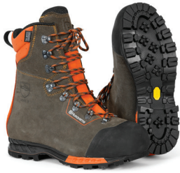
PROTECTIVE LEATHER BOOTS WITH SAW PROTECTION, FUNCTIONAL 24 597 65 93-38