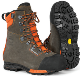
PROTECTIVE LEATHER BOOTS WITH SAW PROTECTION, FUNCTIONAL 24 597 65 93-42