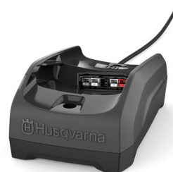
HUSQVARNA CHARGER 40-C80 970 48 78-02