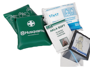
FIRST AID KIT 504 09 53-01