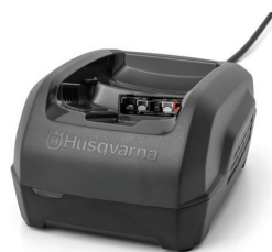
HUSQVARNA CHARGER QC250 967 97 01-02