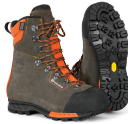
PROTECTIVE LEATHER BOOTS WITH SAW PROTECTION, FUNCTIONAL 24 597 65 93-40