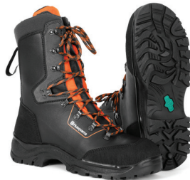
PROTECTIVE LEATHER BOOTS WITH SAW PROTECTION, CLASSIC 597 65 94-45