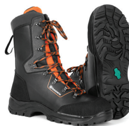
PROTECTIVE LEATHER BOOTS WITH SAW PROTECTION, CLASSIC 597 65 94-39