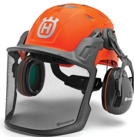
FOREST HELMET, TECHNICAL 585 05 84-01