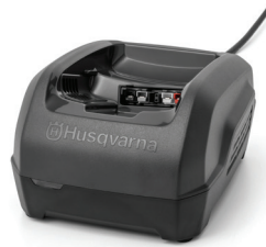
HUSQVARNA CHARGER QC250 967 97 01-02