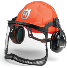
FOREST HELMET, CLASSIC 580 75 43-01