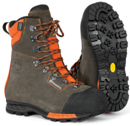
PROTECTIVE LEATHER BOOTS WITH SAW PROTECTION, FUNCTIONAL 24 597 65 93-38