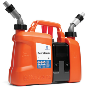
COMBI CAN 580 75 42-01