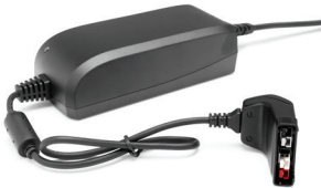
HUSQVARNA CHARGER QC80 967 96 47-03