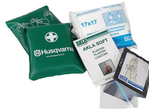
FIRST AID KIT 504 09 53-01