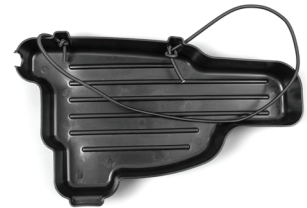
HUSQVARNA CHAINSAW BASE 536 94 48-01