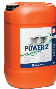
HUSQVARNA XP POWER 2T 583 95 29-02