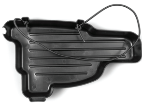
HUSQVARNA CHAINSAW BASE 536 94 48-02