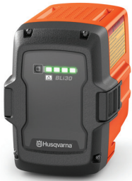
HUSQVARNA BATTERY BLI30 967 93 77-01