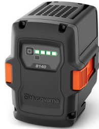
HUSQVARNA 40-B140 970 45 72-01