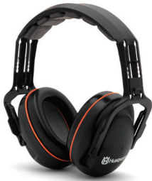
HEARING PROTECTION WITH HEADBAND 505 66 53-04