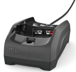
HUSQVARNA CHARGER 40-C80 970 48 78-02