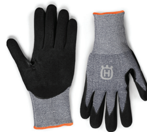
GLOVES, TECHNICAL GRIP 529 88 03-07