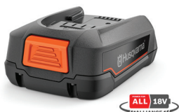
HUSQVARNA ASPIRE™ P4A 18- B45 970 60 08-01