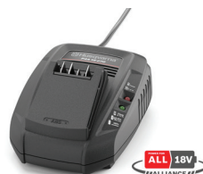
HUSQVARNA ASPIRE™ P4A 18- C70 970 60 10-02