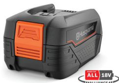
HUSQVARNA ASPIRE™ P4A 18- B72 970 60 09-01