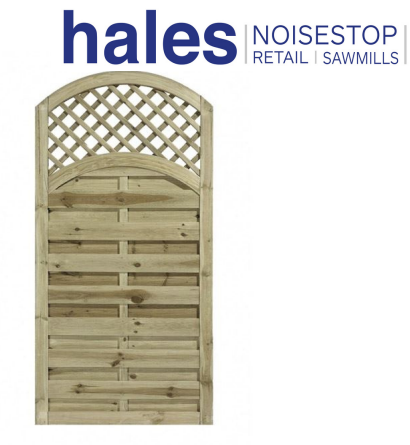
ARCHED LATTICE TOP GATE