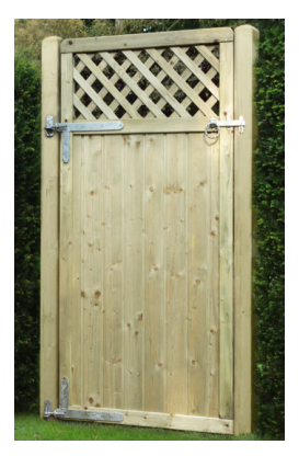
TONGUE & GROOVE LATTICE TOP