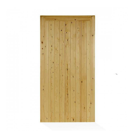
ELITE TONGUE & GROOVE GATE