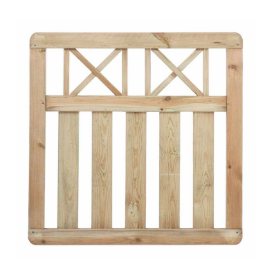
ELITE CROSS TOP