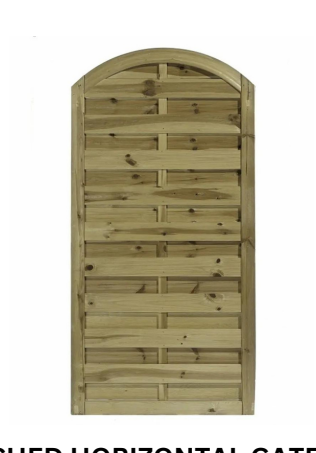
ARCHED HORIZONTAL GATE