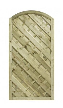
'V' ARCHED GATE